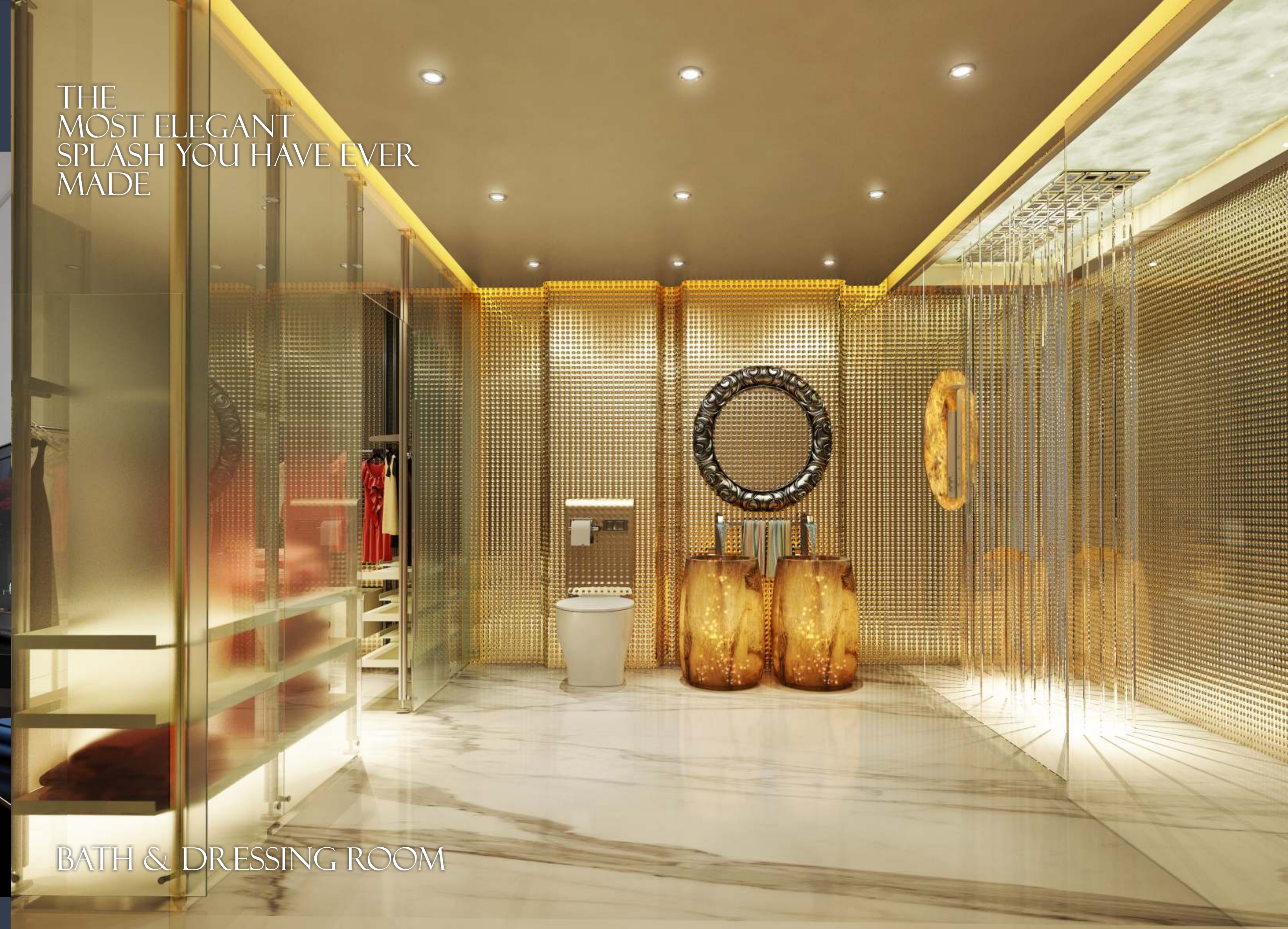
BATH & DRESSING ROOM

THE MOST ELEGANT SPLASH YOU HAVE EVER MADE