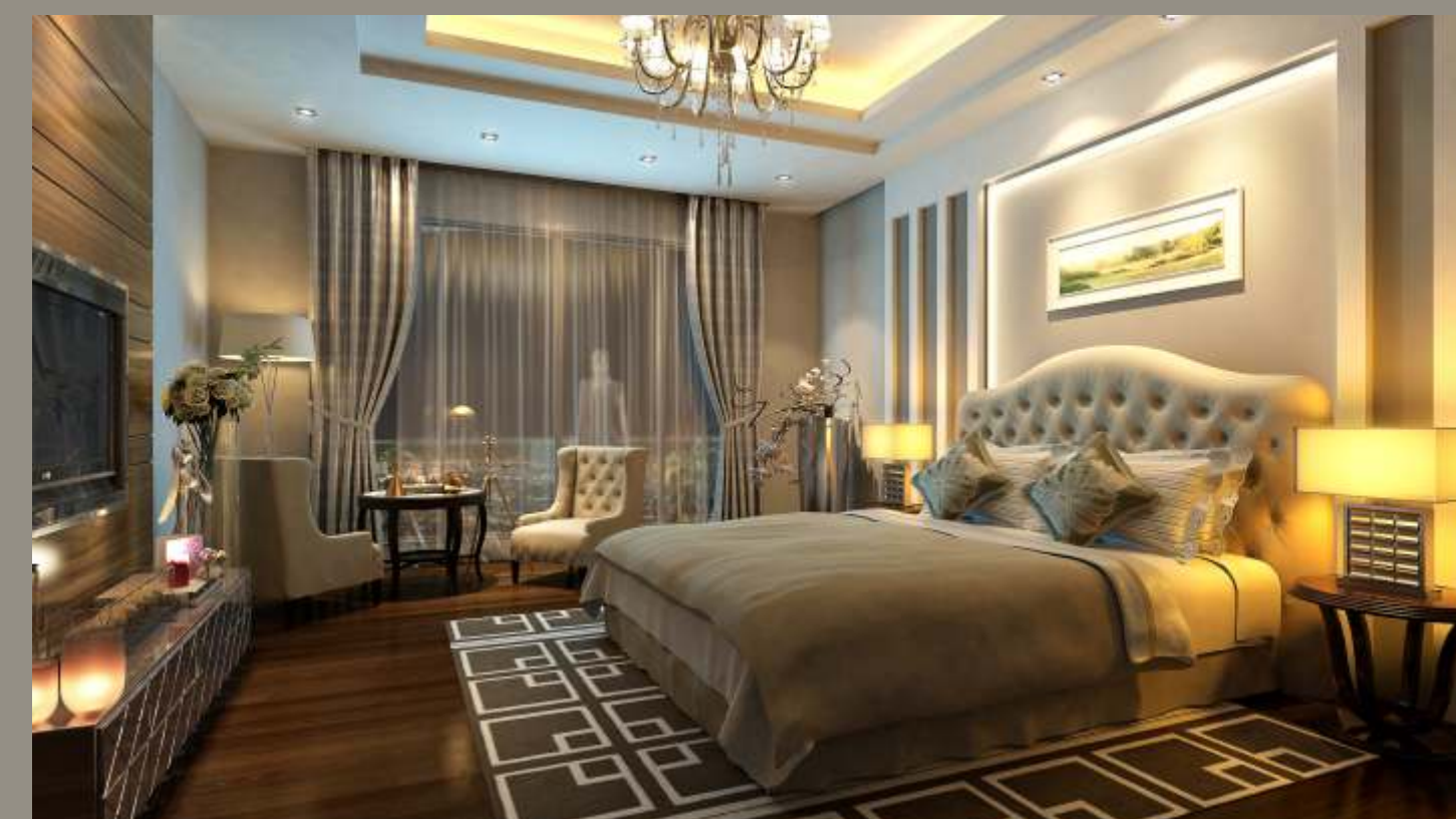
BEDROOM - 5