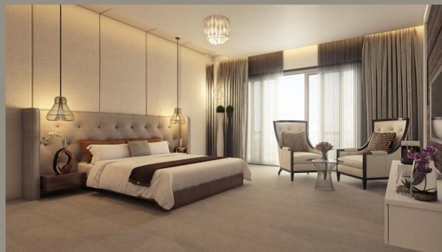
BEDROOM - 4