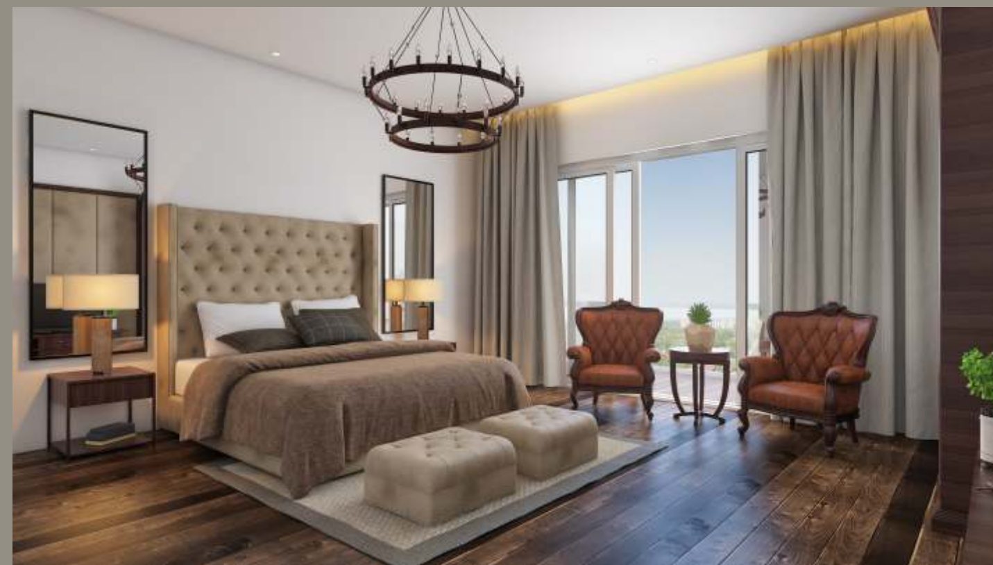
BEDROOM - 2