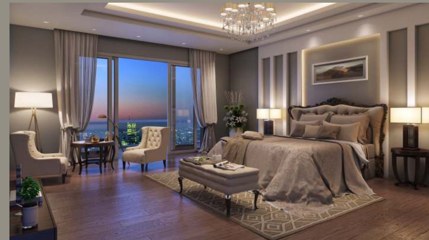
BEDROOM - 3