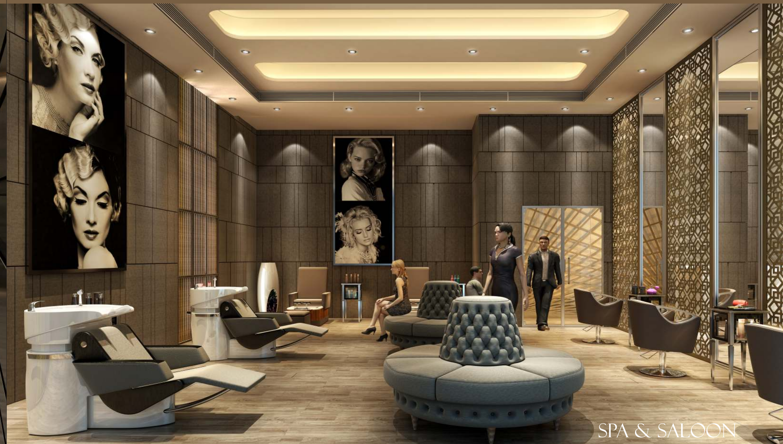
SPA & SALOON