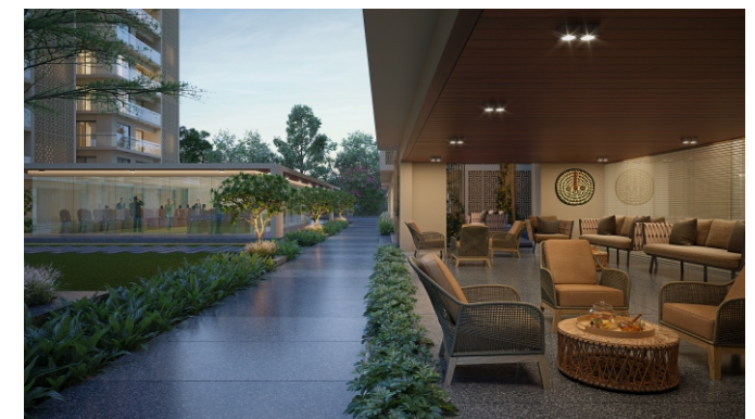
Roman Style Lounge