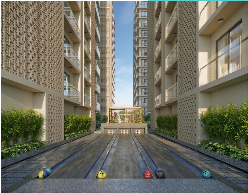
Cricket Pitch or Outdoor Bowling Alley