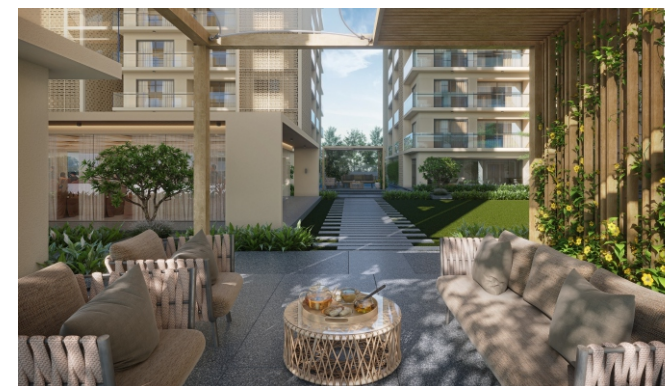
Gazebos & Senior Citizen Area

Painting Room | Study Room | Library | Kids Play Area